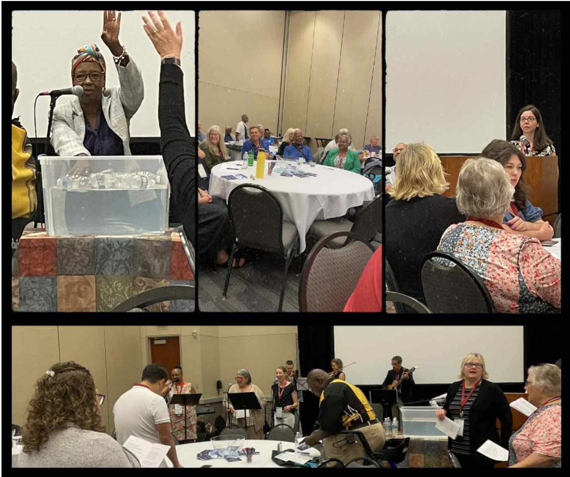
Photos from our Biennial Gathering.

Our heartfelt gratitude for our Biennial planners and volunteers.