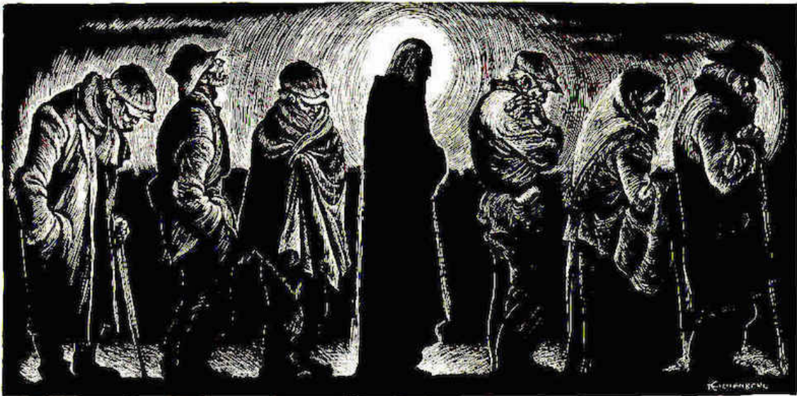
Image: Christ of the Breadlines, wood-cutting, by Fritz Eichenberg

Holy and Loving God, You have called us to walk with Jesus— to follow His steps of love, mercy, and justice. In this Lenten season, guide our hearts to deeper reflection, our hands to acts of compassion, and our feet to paths of justice. Revive our faith in Your power, our trust in Your way, and the gift of unity in Your Spirit. Amen.