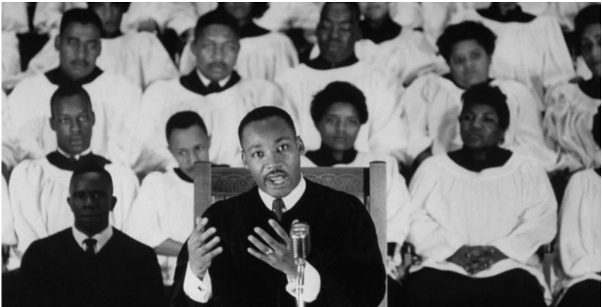
Image: Dr. Martin Luther King delivers a sermon at Ebenezer Baptist Church in Atlanta in September 1960.